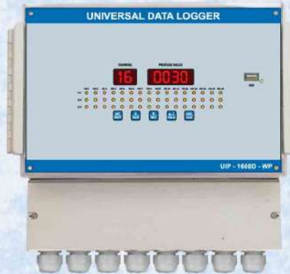
UIP - 1600 / UIP - 1600D - WP WEATHERPROOF