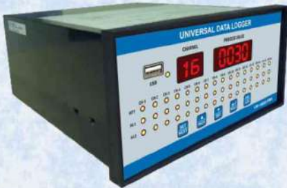
UIP - 1600 / UIP - 1600D - PMH PANEL MOUNT HORIZONTAL